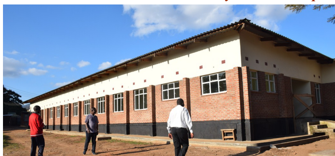
Umodzi ART Clinic at Queen Elizabeth Central Hospital